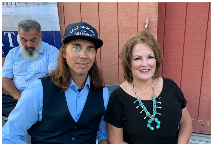
Cole Brocato for Assembly District 38 and Senator Shannon Grove