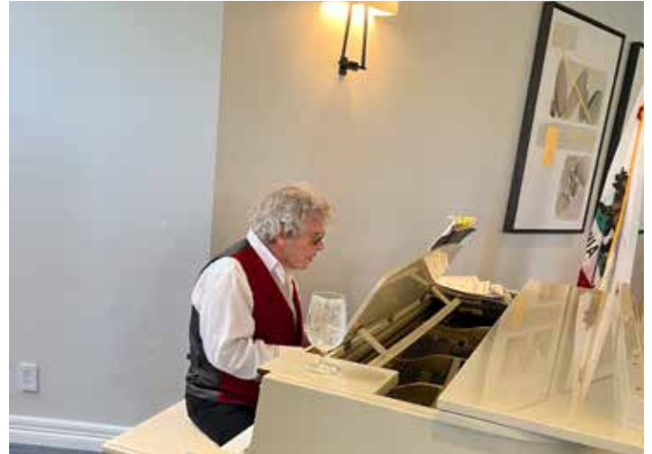
Such a nice touch that adds great ambiance to our events