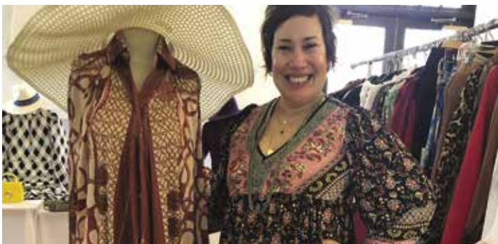
Hazel's Bags at our May Extravaganza!