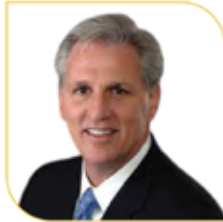
Congressman Kevin McCarthy Representing the 23rd Congressional District of California