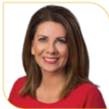
State Senator Melizza Melendez Representing the 28th Senate District of California