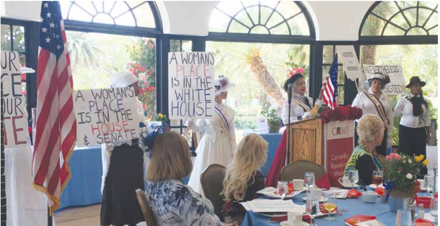
The Passion Players marched in as Key Figures in the Suffragette Movement.