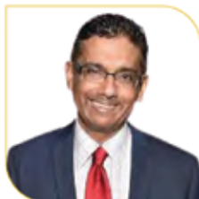
Dinesh D'Souza Conservative Author & Film maker