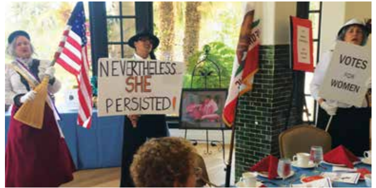
The Passion Players as Key Figures in the Suffragette Movement.